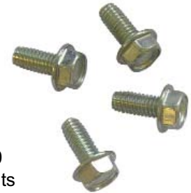
VT7500 Set 4 Bolts 5/16 & 3/4 Hex