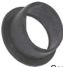
QD05Q0 Gasket for 64mm Bolt-On